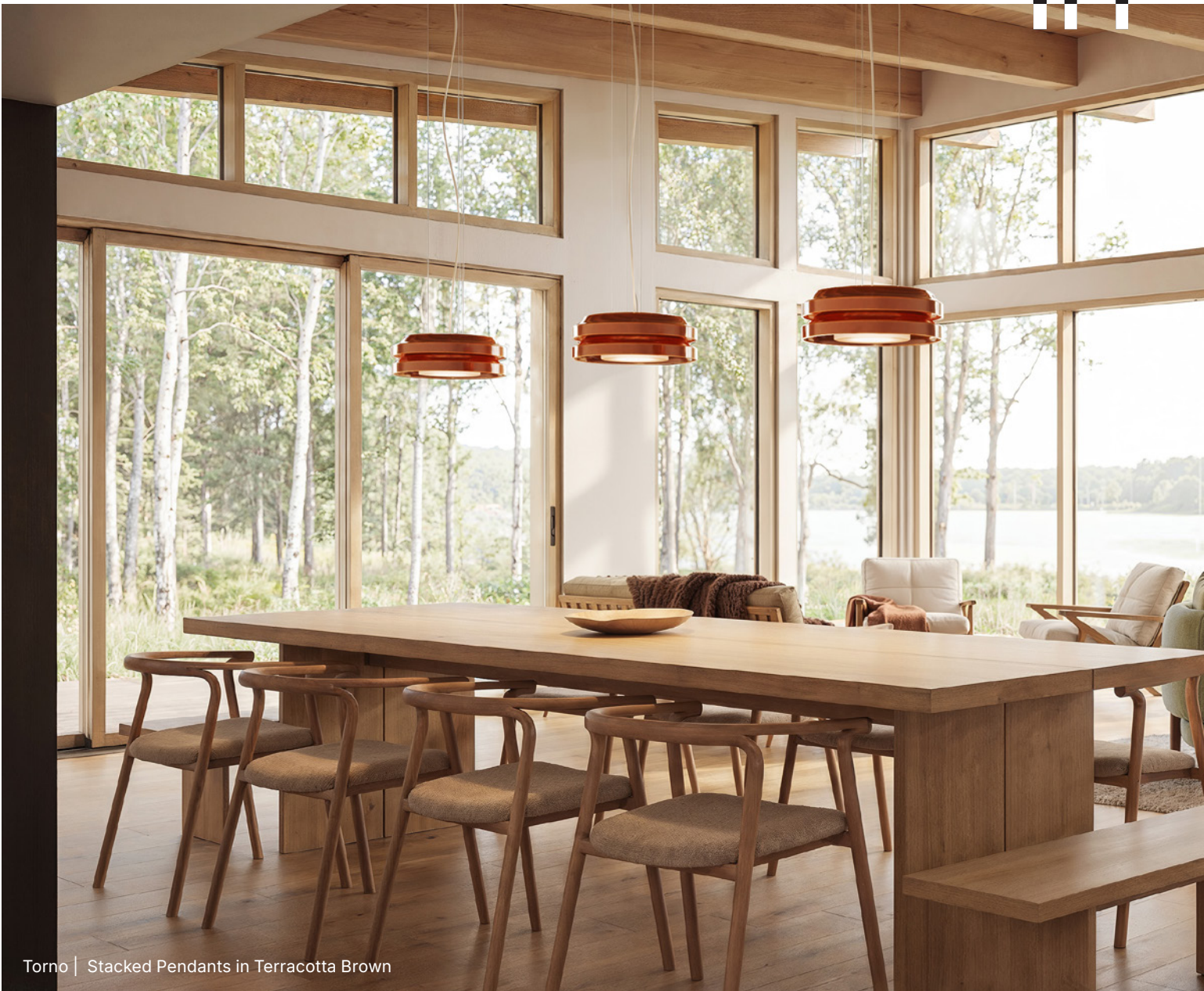
Torno | Stacked Pendants in Terracotta Brown