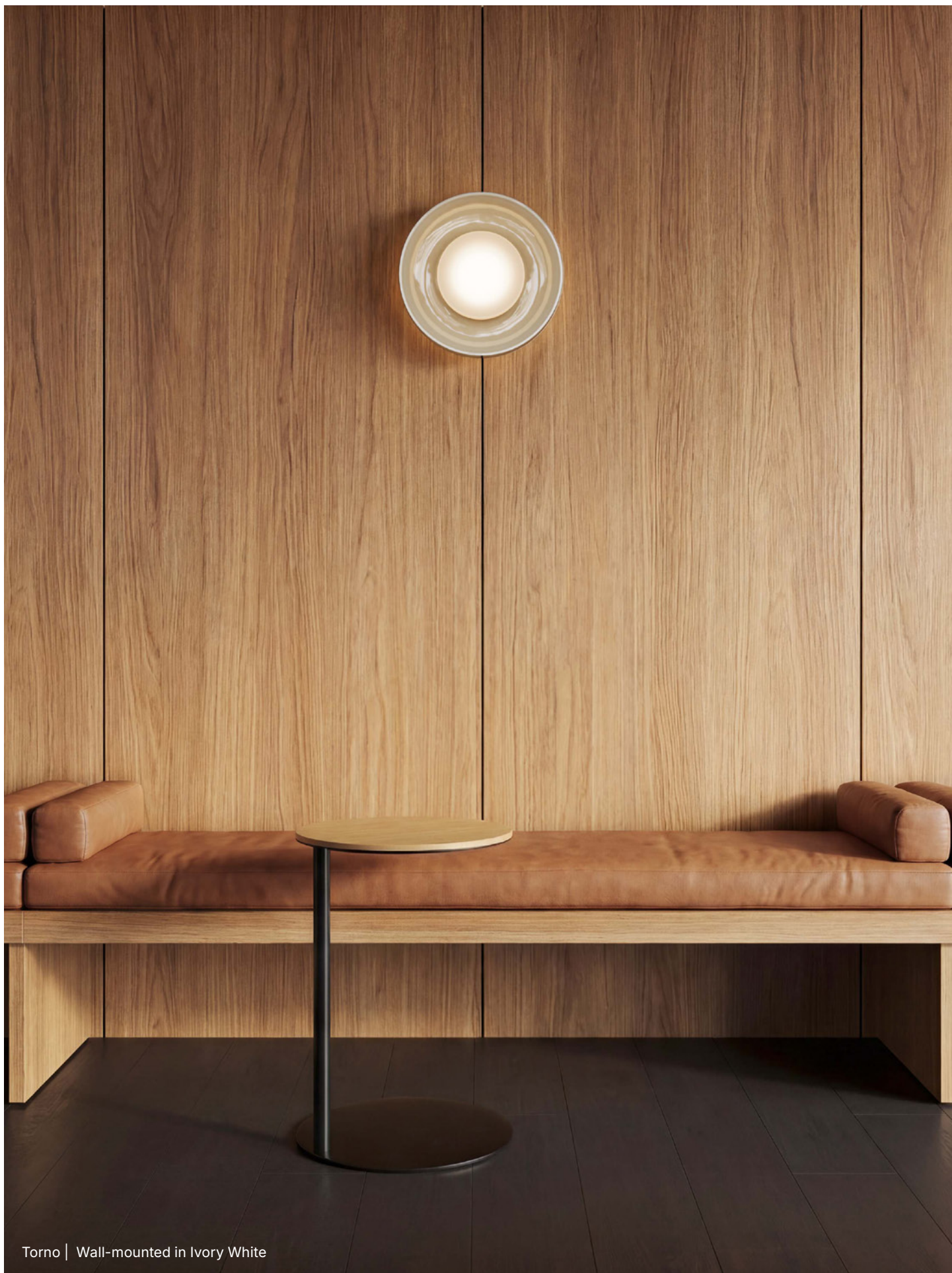
Torno | Wall-mounted in Ivory White