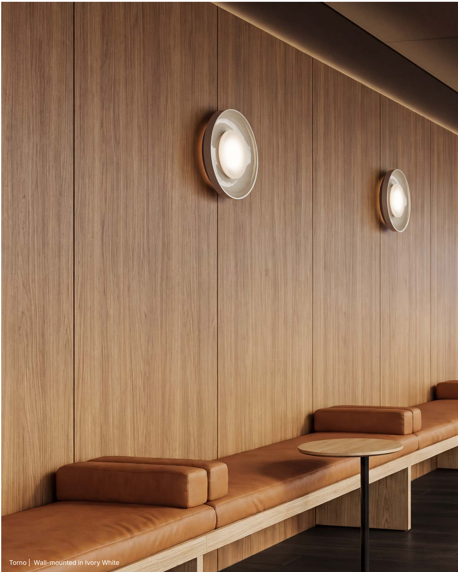
Torno | Wall-mounted in Ivory White