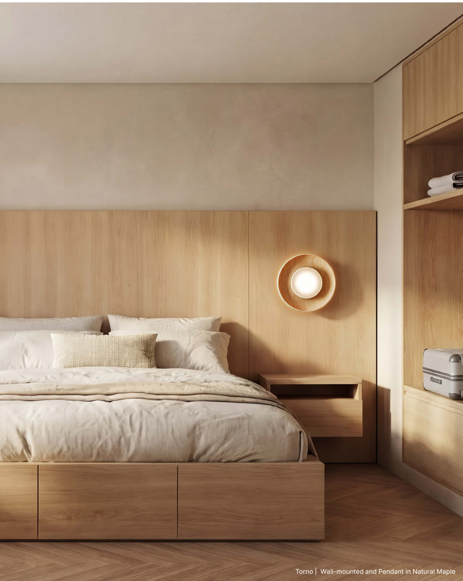
Torno | Wall-mounted and Pendant in Natural Maple