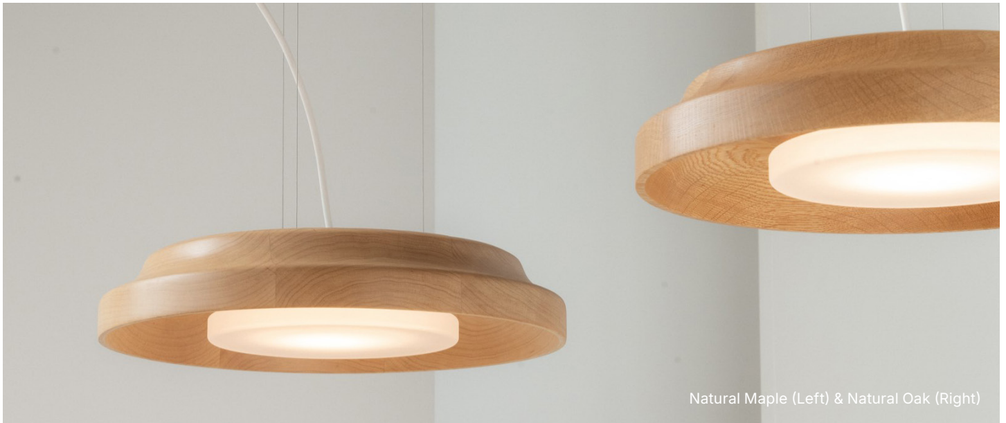
Natural Maple (Left) & Natural Oak (Right)